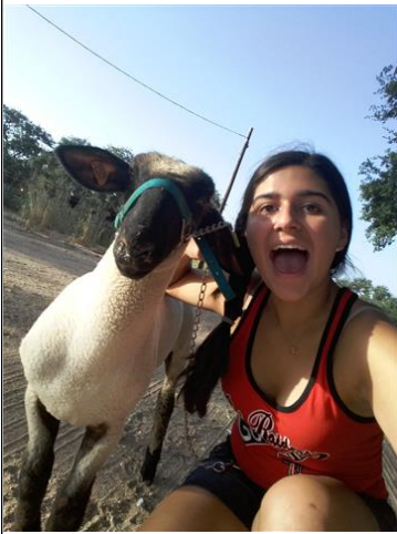
On a walk.