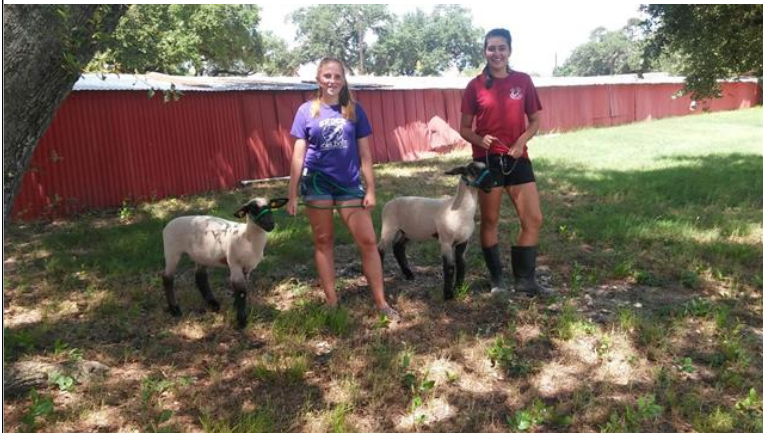
Walking in the pasture in the front.