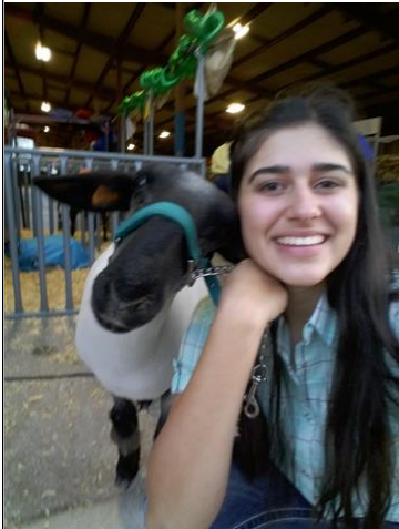
About to show at Travis County Youth Show