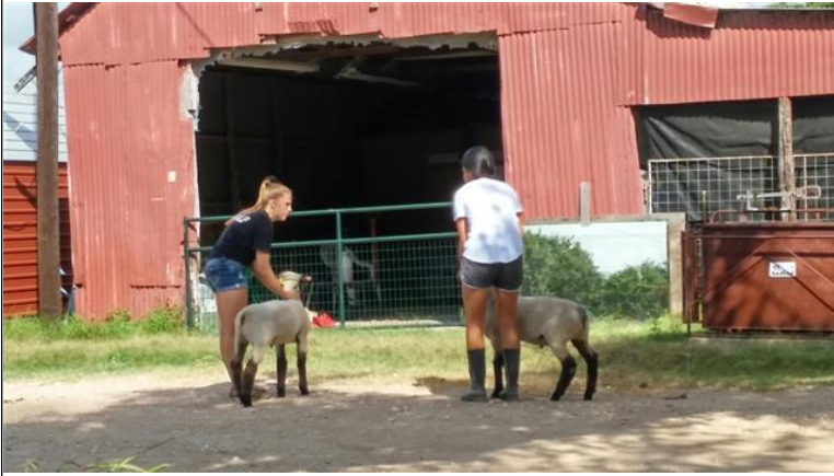
Working in front of mirror.