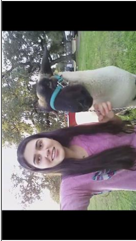
On another walk.